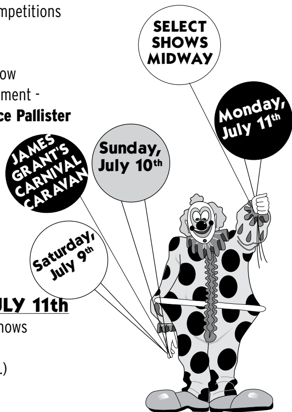
"PINKY" the Clown