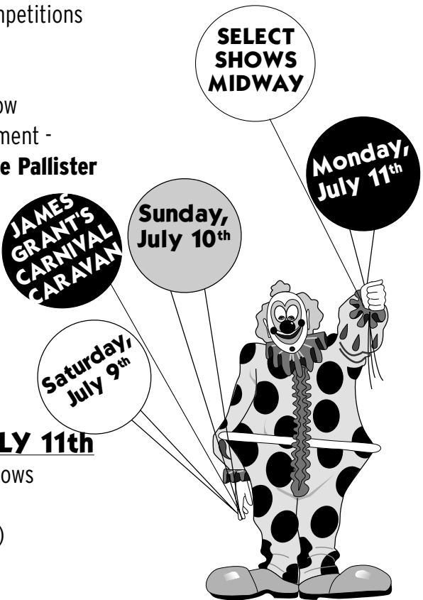
"PINKY" the Clown